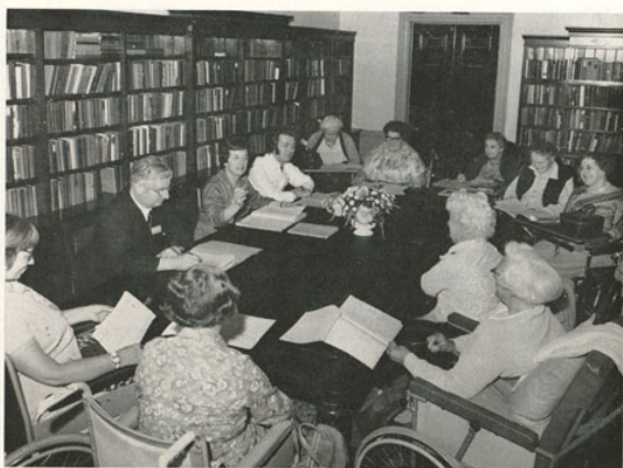
"Patients' Representative Meeting"

Following the full scale review of the Hospital's finances in mid-1971 the Board has been able, by strict adherence to the policies at that time decided, to reduce the annual deficit in 1972 to some £3,000. This is an improve-