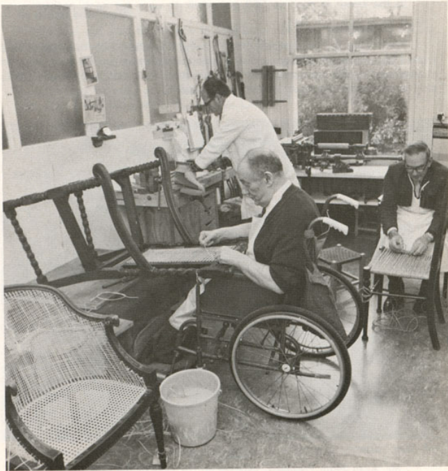
"CHAIRS TO MEND"