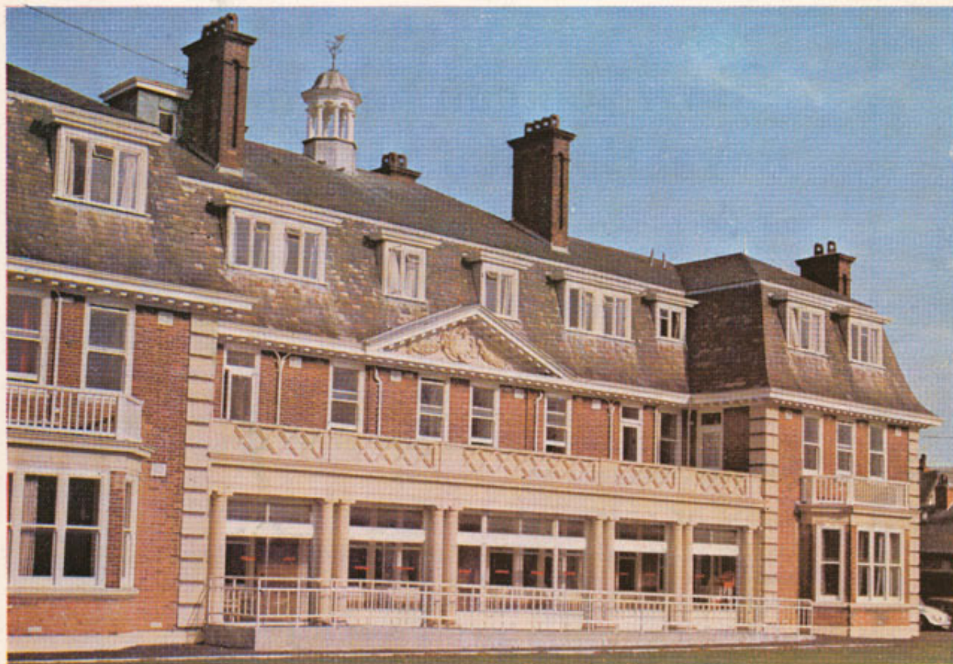
John Howard House, Brighton, our 30 bed hospital unit for recuperation and holidays