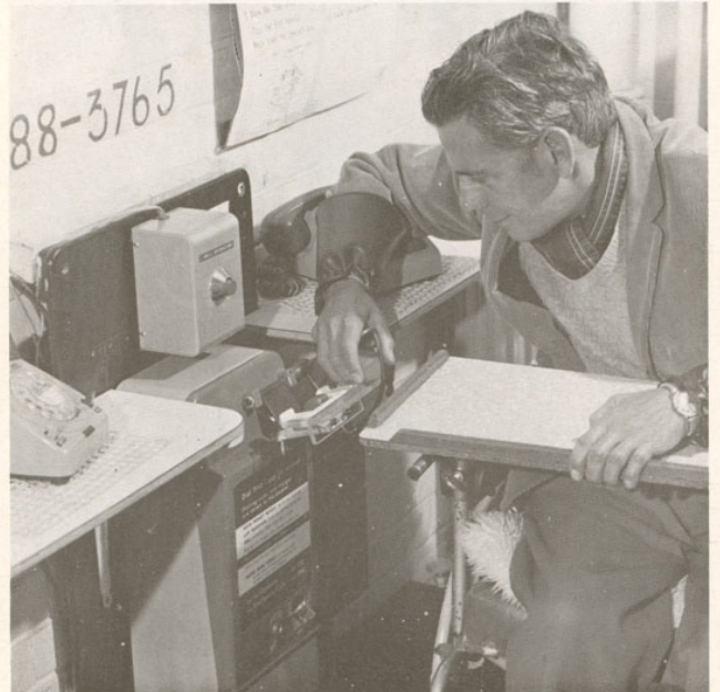
"CALLING ALL PATIENTS"

This is not to say that those above the age of 65 years are unwelcome; but we do ask that they should be "young in heart" and fully capable of enjoying the many activities and diversions available to all.