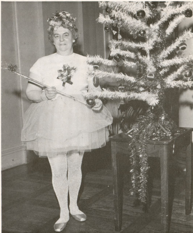
"THE FAIRY QUEEN"

It was 100 per cent oversubscribed; delegates came from many parts of the UK; from many fields of medicine, nursing and therapy. The booklet incorporating the lectures has been given a wide circulation and has been very well received.