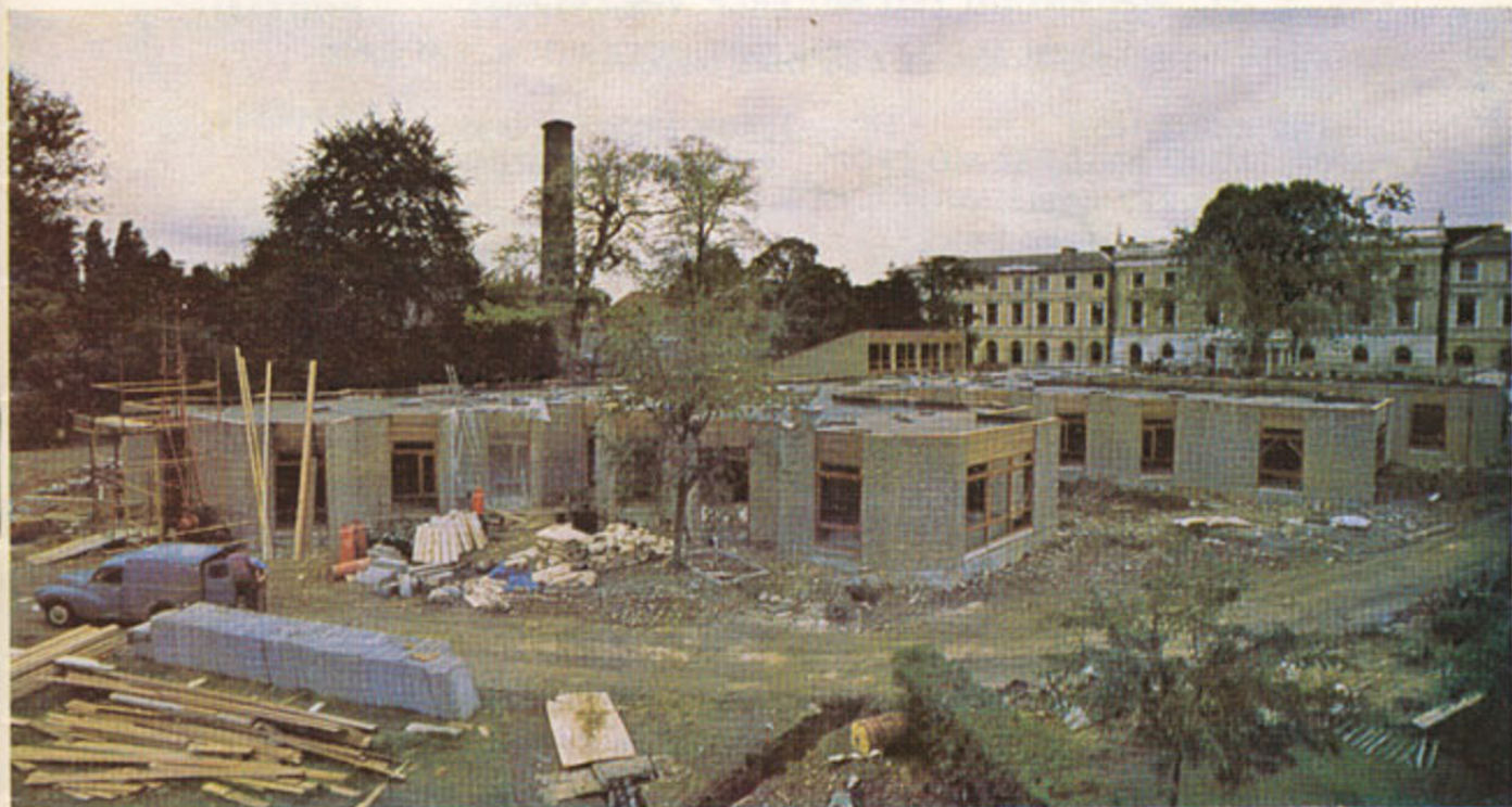
The 30 bed younger disabled unit now being built and due to open in the Spring of 1976.