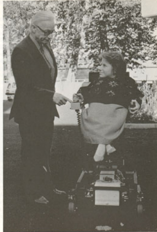
One of the Rehabilitation Engineering Projects.