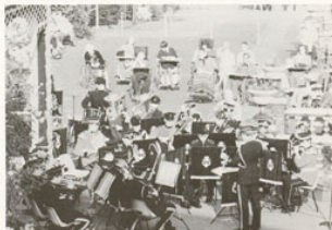
The Royal Military School of Music's Band Concert on the South Terrace