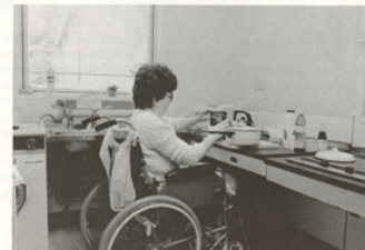
Activities of daily living in the Functional Assessment Unit.