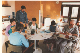
The Self-Care Unit in Chatsworth Wing.