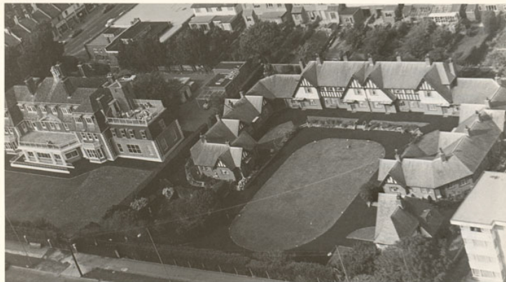
On 1st October 1985 the RHHI assumed the Trusteeship of the John Howard Nurses Homes, which are adjacent to John Howard House at Brighton.