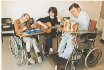
Left: Music therapy.