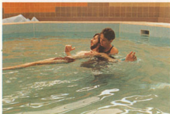
Left: The Haslemere Hydrotherapy Pool.