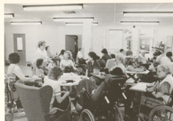
The new Drapers Wing, a major development of the Hospital, has been opened by Her Majesty The Queen on 5th March 1977. The Wing is a twenty-bed ward unit for long term rehabilitation of young adults who have suffered brain damage with severe physical injuries as a result of road traffic accidents. The Wing is a major development of the Hospital and is a testament to the generosity of the Drapers Company and the Development Trust for the Young Disabled.

The work of the ward unit is carried through into the Day Hospital, which is developing well although there is still spare capacity. This is an essential part of our