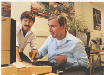
Above: Keyboard training in the Communications Room.