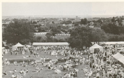
The Annual Garden Party at Putney.