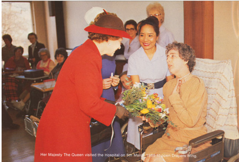
Her Majesty The Queen visited the Hospital on 5th March 1985 to open Drapers Wing.