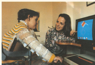
Automated Psychological Testing can be fun.

The severity of disablement of the patients being admitted to the Hospital seems always to be increasing and this, with the expansion to 300 beds and the extra demands of running the new Rehabilitation Unit, has placed a heavy burden on the care staff. At the same time, many new procedures and much new equipment have been introduced during the year, which has meant a considerable training effort for everyone. Despite all this the staff have risen magnificently to the occasion and morale is high. This year's winner of the BP Travelling Scholarship for Nurses visited independent living accommodation for disabled people in Sweden and her excellent report will be useful in the planning of Project Independence.