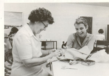
Occupational Therapy in the Day Hospital.