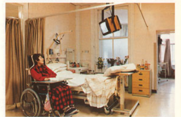
The Glyn Ward extension is an example of what the Main Hospital Wards will be like when Project New Look has been completed.