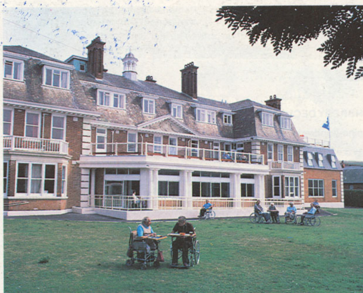
John Howard House, our Hospital at Brighton for thirty-four long stay and rehabilitation patients.

"I give all my property not otherwise disposed of by this my Will subject to and after payment of my funeral and testamentary expenses to THE ROYAL HOSPITAL AND HOME FOR INCURABLES, WEST HILL, PUTNEY, LONDON, SW15 3SW, and I direct etc. (as above)."