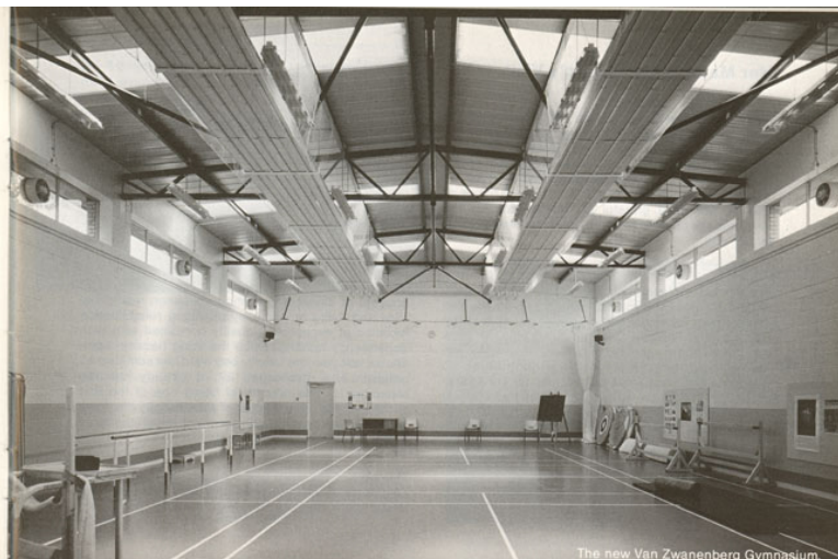
The new Van Zwanenberg Gymnasium.

To promote teaching programmes and publications, and to disseminate information on the treatment and care of severe physical disability.