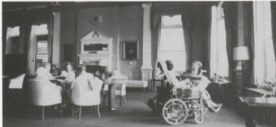
The De Lancey Lowe Room.