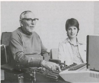
Automated Psychological Testing.