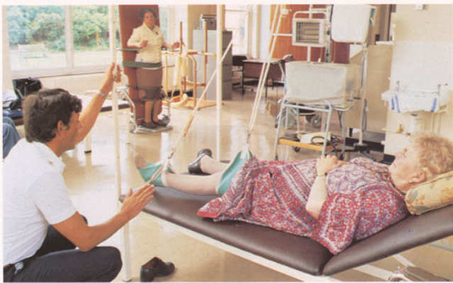
Physiotherapy at John Howard House.