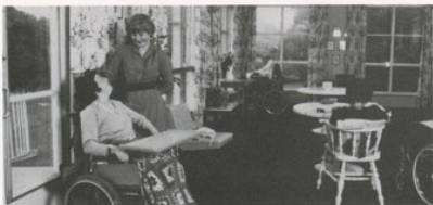
The Douglas Gracey Verandah.