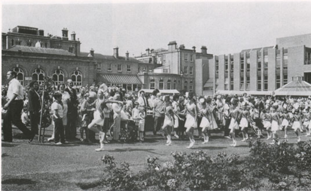
Annual Garden Party at Putney.