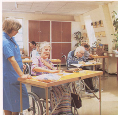
Occupational Therapy at John Howard House.