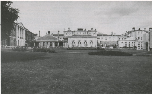
The Main Hospital viewed from the South.