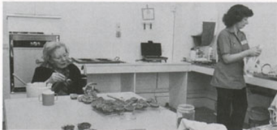
The Therapy Kitchen.