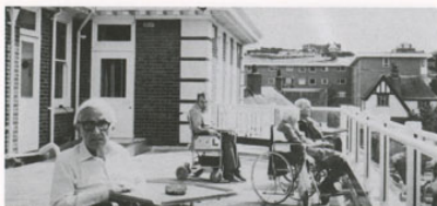
The Lower Sun Terrace at John Howard House.