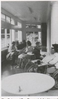
The Enlarged Day Room at John Howard House.