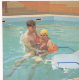
The Haslemere Hydrotherapy Pool.

There are over 200 active members in our County Committees, and they have done wonders on our behalf during this very difficult year. Apart from their financial support, the Committees do much to spread the word about the work of the Hospital and this helps to swell the ground support that we need so badly. The