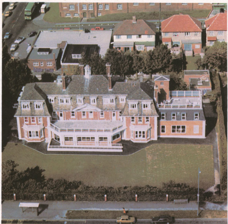
John Howard House, our Hospital at Brighton for 34 long-stay patients and for out-patient rehabilitation.

“I give all my property not otherwise disposed of by this my Will subject to and after payment of my funeral and testamentary expenses to the ROYAL HOSPITAL AND HOME FOR INCURABLES, WEST HILL, PUTNEY, LONDON SW15 3SW. And I direct etc. (as above).”