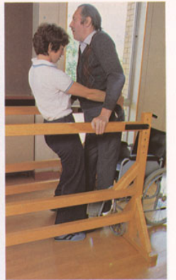
Remedial Gymnasium at Putney.