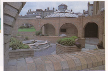
The Herb Garden.