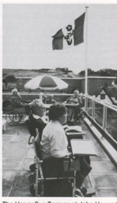
The Upper Sun Terrace at John Howard House.