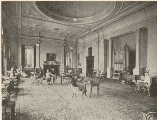
The Assembly Room

Cinema shows are given once a week, except during the summer, and the Assembly Room is always filled to capacity during the showings.