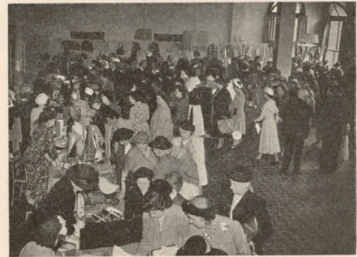
Sale of Work