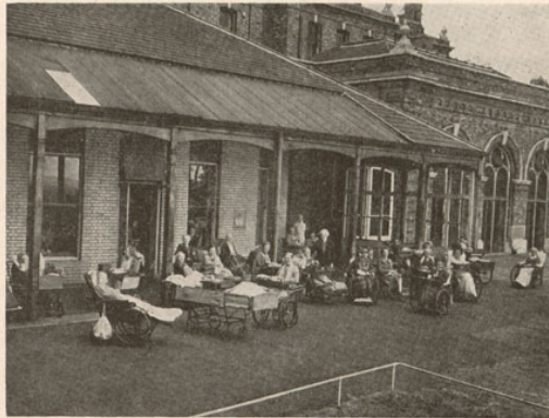
An Afternoon on the Verandah