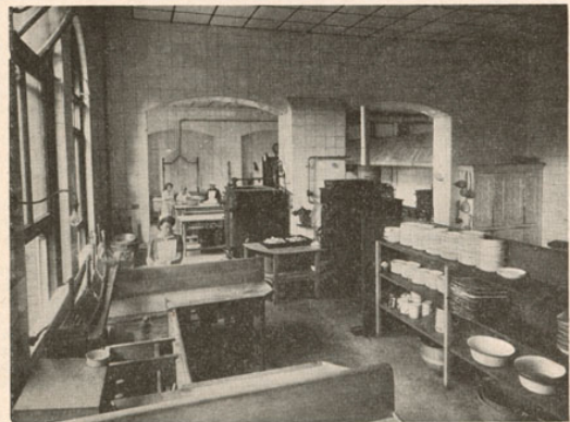
Part of the Kitchen